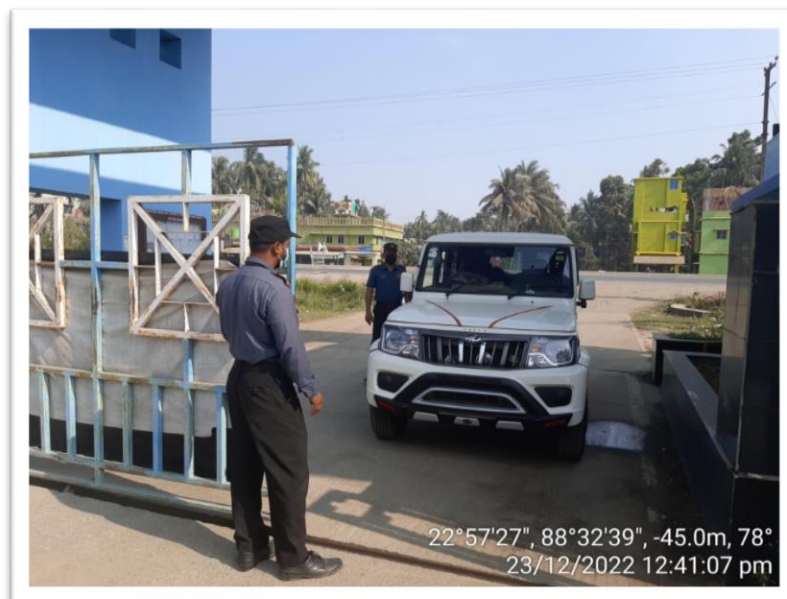
Fig. : 7.1.5.1.b. : Registration of automobiles at MAKAUT, WB., Haringhata Campus Main Gate.