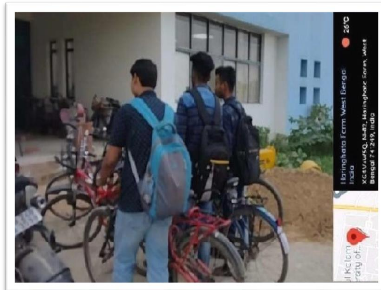
Fig. : 7.1.5.2.a. : Local commuters use bicycle as preferable modes of conveyance, MAKAUT, WB. at Haringhata Campus