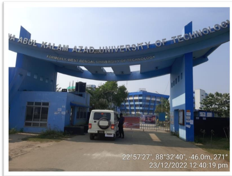
Fig. : 7.1.5.1.a. : Restricted entry of automobiles at MAKAUT, WB., Haringhata Campus.